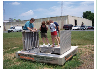
Photos above: The BMP Project Tours offer a in depth look at the various options available to prevent stormwater pollution.