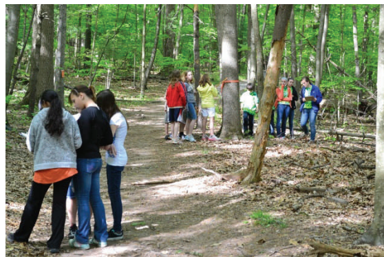
Teams were hard at work identifying trees at the Forestry station during the Junior Envirothon!

Then on May 10th, the Berks County Conservation District held its middle school Envirothon. Sixteen middle school teams competed at Nolde State Forest. The middle schools that participated were: Oley Valley, Fleetwood, Exeter, North East, North West, South West, Commonwealth Connections Academy, and Tulpehocken. The winning team was Fleetwood Team A-1. Oley Valley Team C-1 and Oley Valley I-2 took second and third place respectively. Congratulations to all of the students who participated in the 2011 Envirothon!