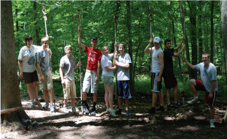
These Don Hartman Conservation Leadership School Students quickly mastered Nolde’s low ropes course!

Each summer the Berks County Conservation District, along with the Department of Conservation of Natural Resources-Nolde State Forest, host the Don Hartman Conservation Leadership School. This past summer students from all over Berks County (and Pennsylvania) came to Alvernia University to learn about the potential effects that climate change could have on Berks County wildlife, vegetation, food production, and water resources. Students learned about these subjects while hiking at Hawk Mountain, visiting the Western Berks Water Authority and the Berks County Community Foundation’s green building, calculating their carbon footprints and interactively discussing agriculture and climate.