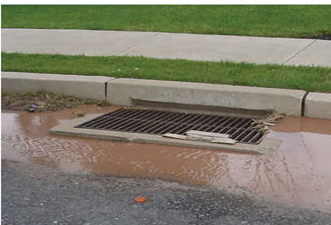
Water that has washed the soil off the land will flow directly into a nearby stream

Stormwater is water from rain or melting snow that does not quickly soak into the ground. Stormwater flows from rooftops, over paved areas and bare soil, and through sloped lawns and fields. As it flows, this runoff collects and transports soil, pet waste, pesticides, fertilizer, oil and grease, leaves, litter and other potential pollutants. You do not need a heavy rainstorm to send pollutants rushing toward Berks County's streams, wetlands, and lakes—in fact even a single garden hose can supply enough water. Storm drains and sewers are designed to move runoff from your neighborhood to the nearest body of water so that flooding does not occur.