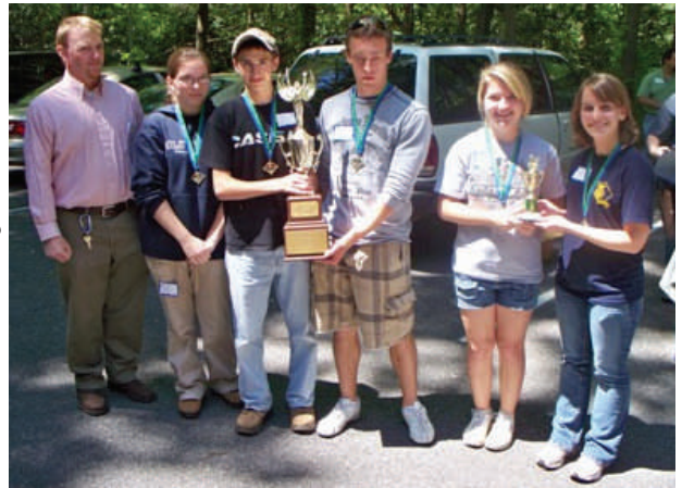
Oley Valley High School - Team C and advisor poses with their trophy

The Envirothon is the most popular high school environmental knowledge competition in North America. Students were rigorously tested in areas of aquatics, wildlife, soils and land use, forestry, and ground water. With help from the Pennsylvania Bureau of Forestry, Pennsylvania Game Commission, Pennsylvania Fish and Boat Commission, and the Natural Resources Conservation Service, thirteen teams from various Berks County High Schools competed for the opportunity to go on to the Pennsylvania Envirothon. The winning high school team was Oley Valley's Team C. Oley Valley Team K and Con-