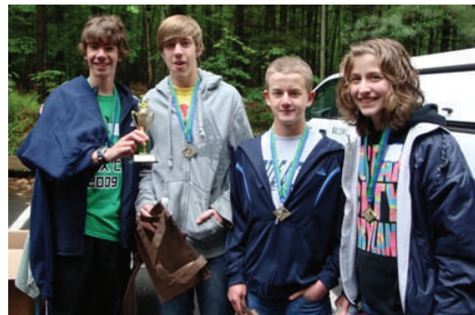
Tulpehocken Middle School - Team A are all smiles as they win the Junior Envirothon

Berks County Conservation District 1238 County Welfare Road Suite 200 Leesport, PA 19533 610-372-4657